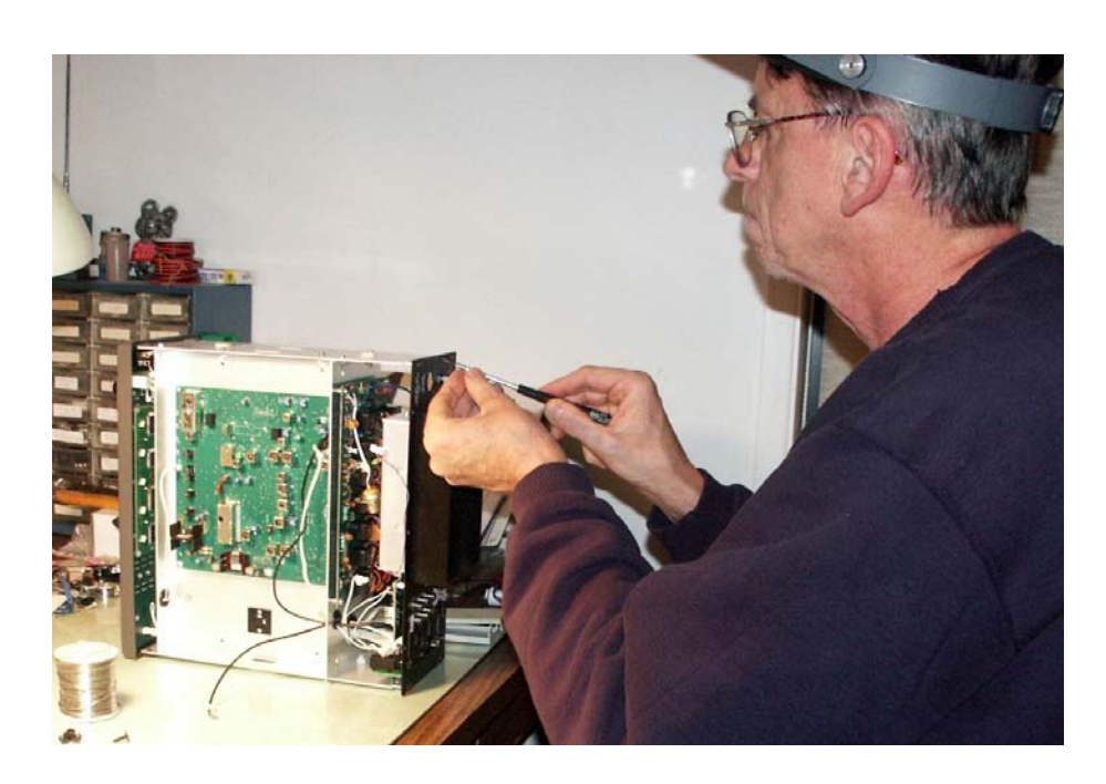
VE7TK / VE7ASR trying to keep track of all the screws!

6. With the screws removed from the rear panel it should now be possible to rotate the rear panel with the power amplifier and associated subassembly board out of the way.