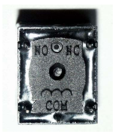
Relay – Coil and common connection are at the bottom of the figure

Each relay has 5 pins and with 3 pins at one end and 2 pins at the other end. As indicated in the figure, the relay coil contacts are located on either side of the relay common pin.