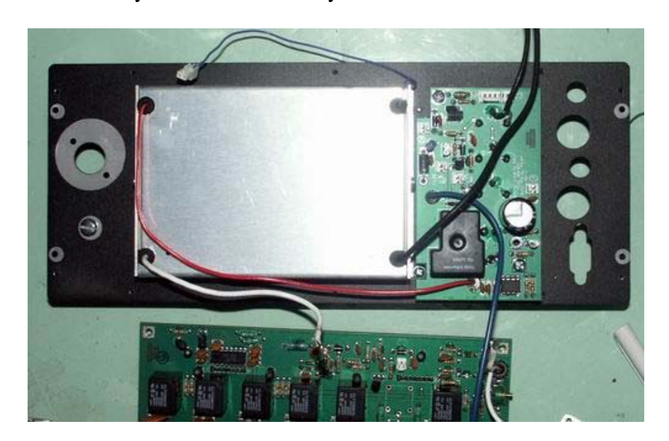
Rear panel with low-pass filter board attached

6. With the screws removed from the rear panel it should now be possible to rotate the rear panel with the power amplifier and associated subassembly board out of the way.